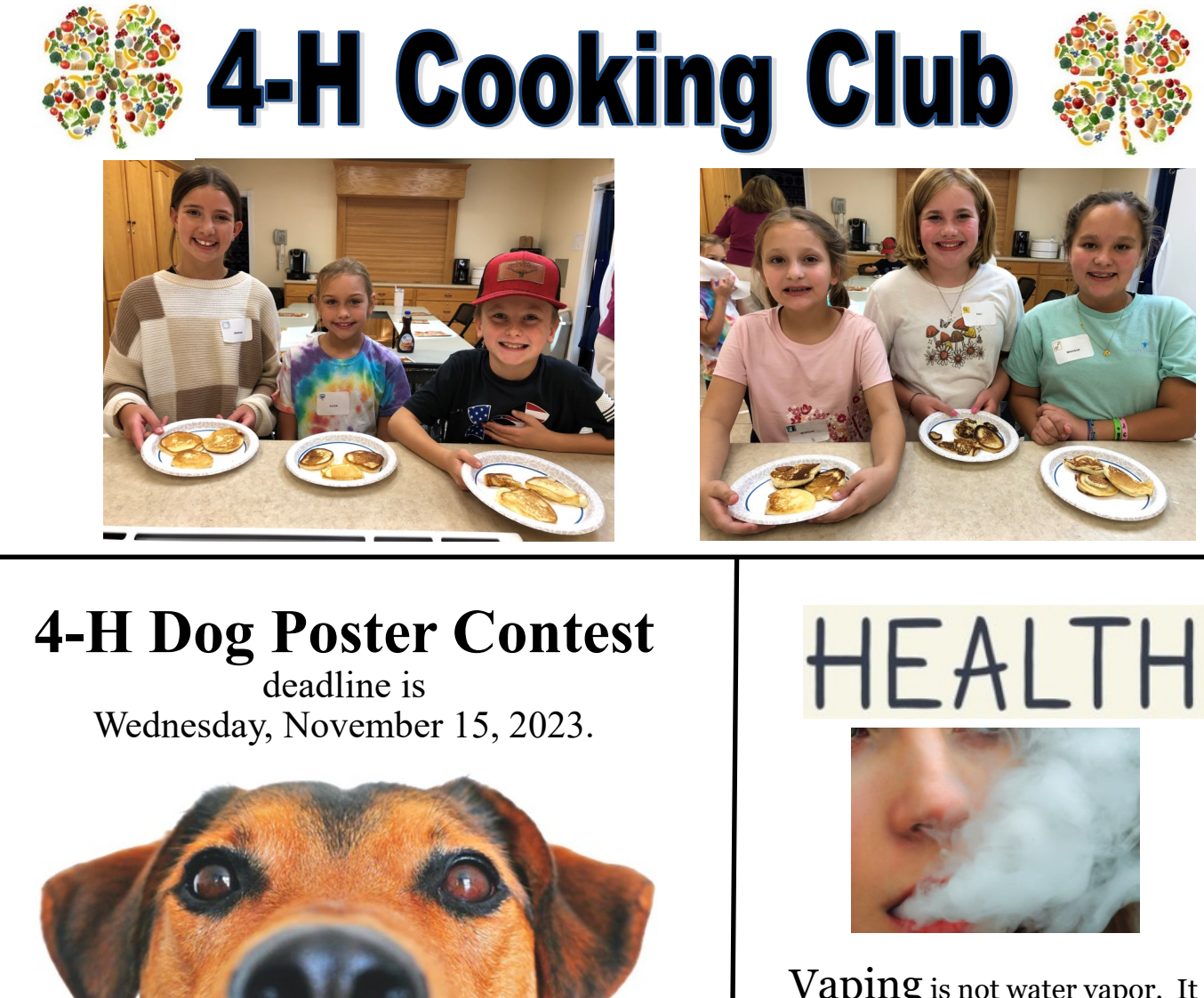
Vaping is not water vapor. It is an aerosol that contains many harmful chemicals!