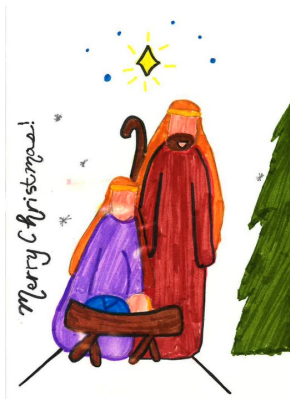
Molly Hammond — SES