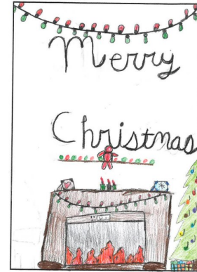
Paisley Bates — RSES